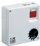
C 1.5 (COMANDO EL. 1.5 A)