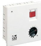
SCNRB I Code 12971