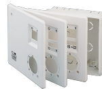
KIT SCB (TRASF.E.C.)