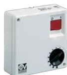
C 2.5 (COMANDO EL. 2.5 A)