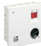
SCNRB SCAT.COM.NON REV.INCASSO