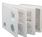
KIT SCB (TRASF.E.C.)