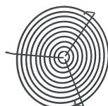
CA-G 200 (GRIGLIA DI PROTEZIONE)