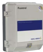
IRET INVERTER 2,5 M

ITALY Pre Sales: prevendita@vortice-italy.com After Sales: postvendita@vortice-italy.com