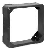
DPU 250 (Distanziatore) 2,5 M PER INFORMAZIONI / FOR INFORMATION